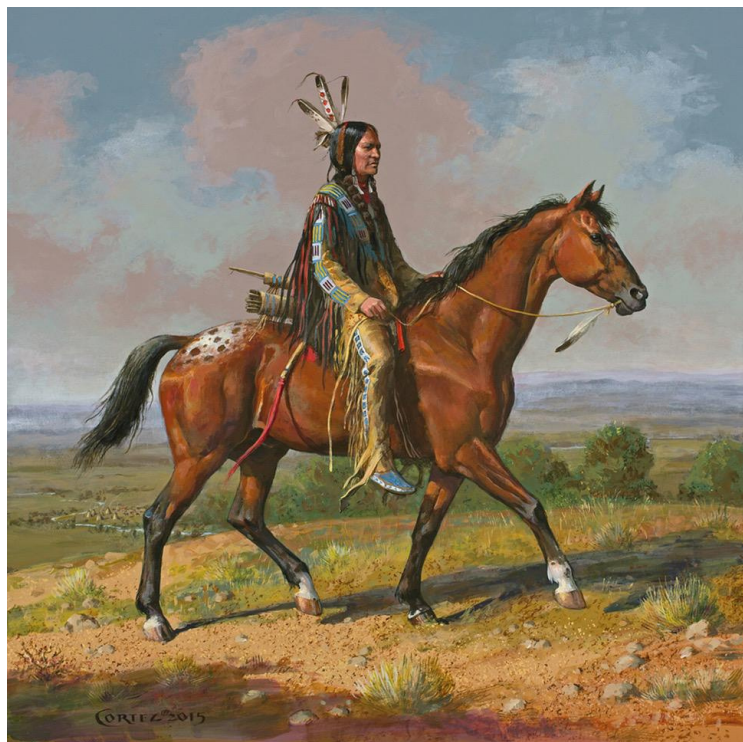
"Running Antelope - Thathoka Inyanke"